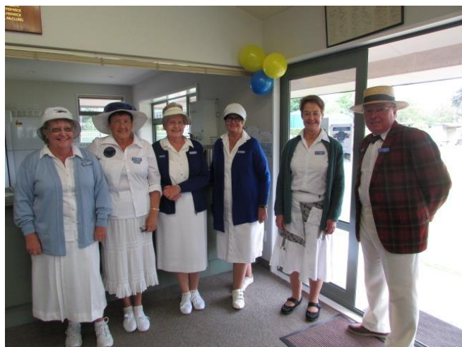
Some 1950s outfits!

On 12 November we celebrated our 65 th Anniversary with a fun afternoon and spit roast dinner. The committee and some of the members dressed up in the fashion of the 1950s, and croquet had to be played from the side. What fun we had.