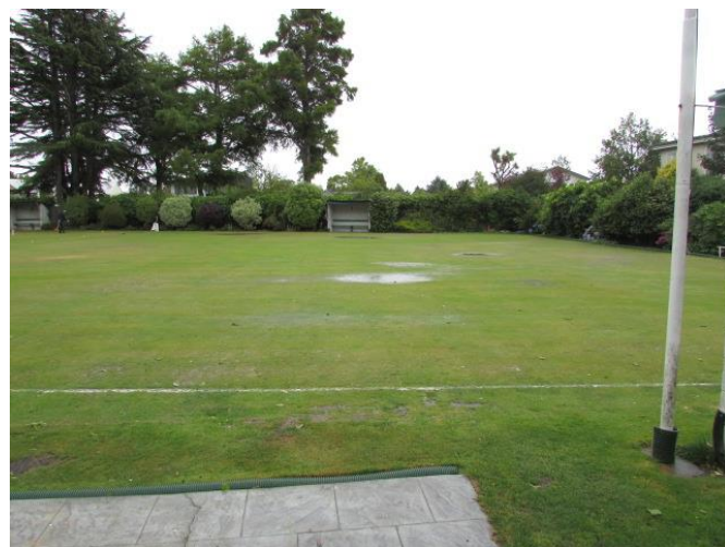
The lawn we couldn't use