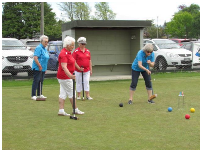
Players from St Martins (blue) and from Ashburton (red)