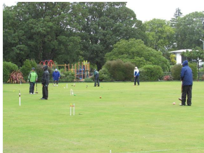
Wet weather gear and puddles on the lawns